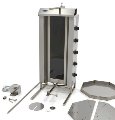
Easy to dismantle and clean