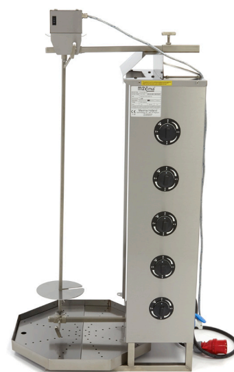
With adjustable skewer for perfect preparation.