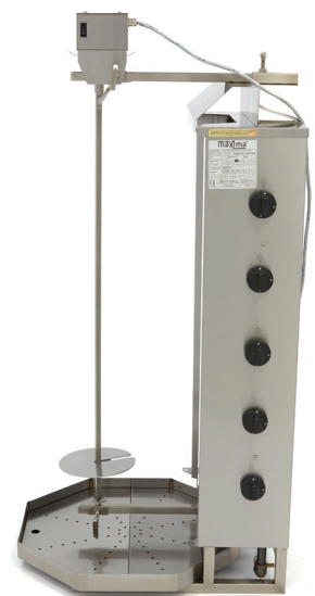
With adjustable skewer for perfect preparation.